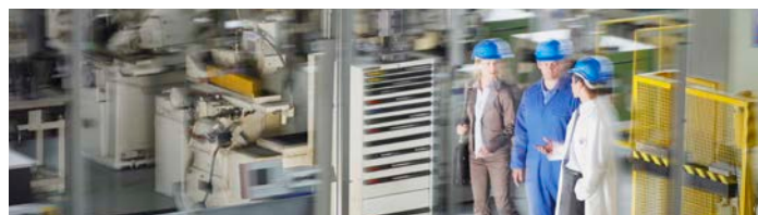
Convention suggests their pay should be rising faster

The headline UK unemployment rate, which peaked at 8.5% in 2011, has been defying traditional economic wisdom since wrong-footing the Governor of the Bank of England. When Mark Carney issued guidance in August 2013, he said no interest rate rise would be considered until unemployment fell to 7%.