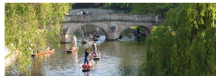
Getting more for their money as sterling struggles

ONS figures were brighter on foreign visitors to the UK, whose euros and dollars buy more pounds to spend here. June visitor numbers were up 7% year-on-year, with those from North America one-third higher.