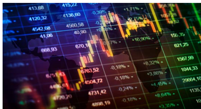
Global equities remain mainly in positive mood

On the continent, the Eurostoxx50 fell 0.81% at month end to finish on 3,421.47. The Japanese Nikkei225 lost 1.40% in August closing at 19,646.24. Asian markets have been jolted by North Korean missile testing over Japan. Theresa May has recently concluded a three-day visit to Japan to discuss trade and security, in a bid to convince Japan that London and Tokyo are perfect partners for the post-Brexit world.